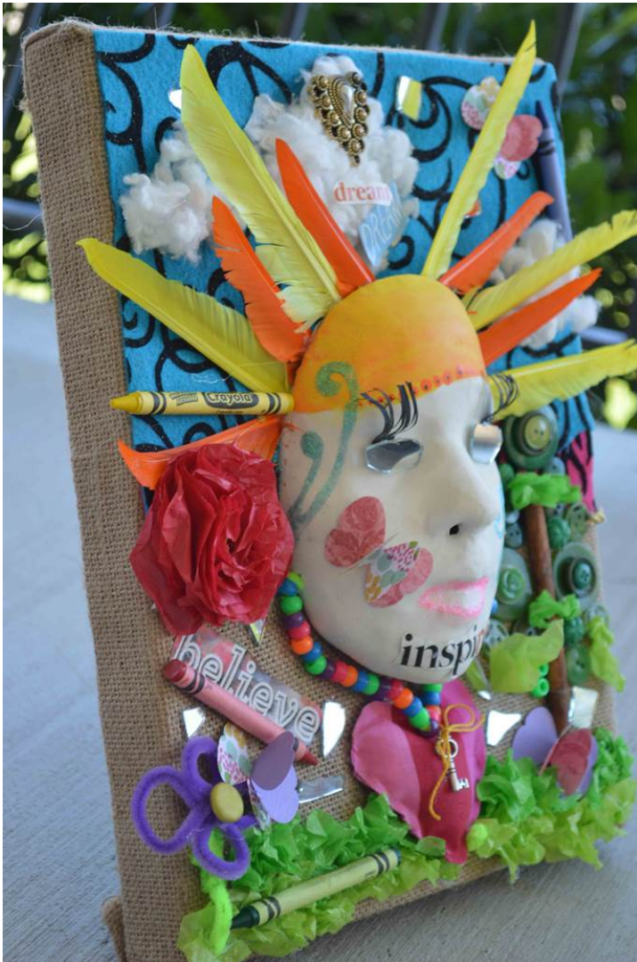
2013-2014 Reflections Student Artwork, UT