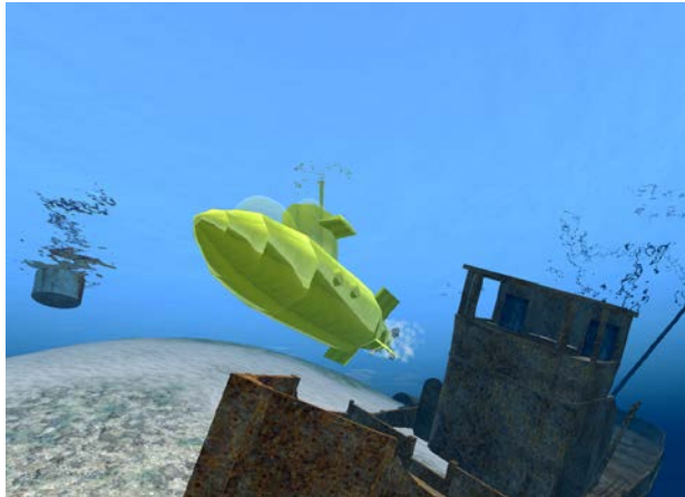
Computer Generated Image by Wikipedia

Computer Generated Image = image created from scratch using computer software.