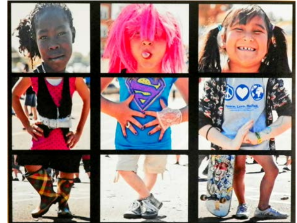
Reflections Student Artwork by Kobie Long, IA

Photomontages = 1 seamless print of multiple original photos. Produced digitally using photo editing software.