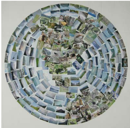
Reflections Student Artwork by Brynn Grambow, NH

Photographic Collage = many photo prints pasted on to a flat surface.