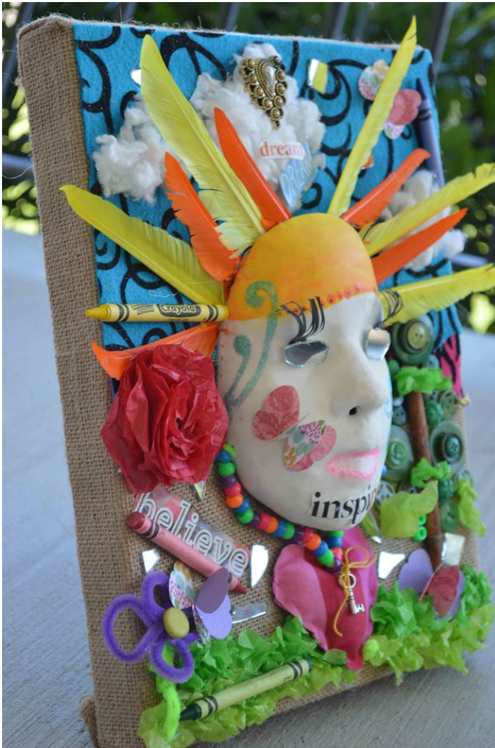
2013-2014 Reflections Student Artwork, UT